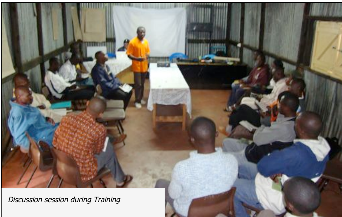
Discussion session during Training

Solafrica.ch works with young people and local community organizations as change agents by providing them with training and capacity to achieve its goals. Solafrica.ch is actively involved in Kenya, Cameroon, DRC Congo and South Africa. In Switzerland, solafrica.ch organizes workshops for young people and scouts to sensitize them on solar energy systems besides other sustainable energy sources. Furthermore we also discuss in the workshops issues of climate change and particularly how individual activities contribute to accelerate climate change.