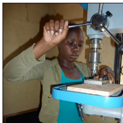
Production of Lamps

Since February 2010 there is a regular export of the solar lamps made in Kibera to Switzerland. The lamp was developed here in Switzerland and is now being produced in Kibera, with the young people we trained. They first sell the lamps there and a part is sold in Switzerland mainly for workshops. The money is used for paying the salaries, materials and also to help lower the cost to make it affordable to the people there.