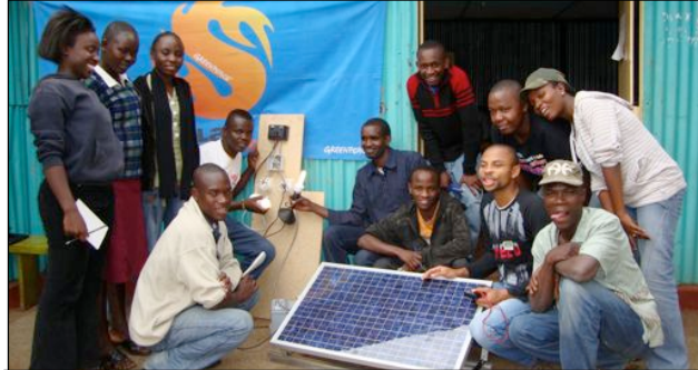
Solar technician training in Kenya