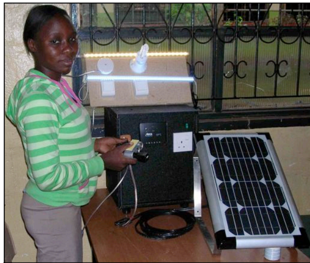
Solar power station prototype

A solar power station was developed with a simple concept of plug and go system. The technology is uncomplicated because the batteries, charge controller and inverters are assembled in a box by the technician. Solar panel is plugged in the inlet box while the outlet is designed for lighting and other charging devices. The technology protects all the gadgets, as the customer cannot tamper with any parts of the system. It is suitable for homes, schools and