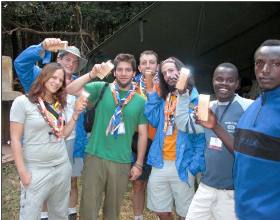
Workshop at the Moot in Rowallan Camp in August 2010.

We have a joint venture with the World scout movement to develop the content of a solar scout badge. A Scout solar badge will be acknowledgment of an accomplished specific task or training or activity and passing a test by a member. It will include assembling of the kibera solar lamp, PV besides learning other solar related tasks, like cooking, games etc. The badge will be won as a show of achievement and very attractive and popular with Kids. The first tests of the programme has been proposed to begin in summer 2011 in Switzerland at Kandersteg International Scout center and Rowallan camp in Nairobi (Kenya) and maybe in South Africa.